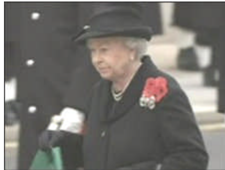
The Queen Places a Wreath at the Cenotaph