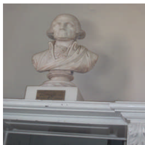
George Washington Views the British Visitors with Disdain