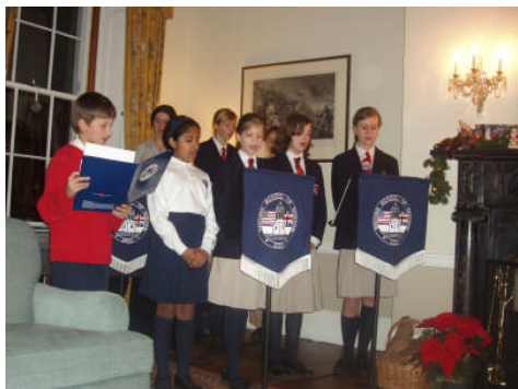
The Choristers of the British School of Boston