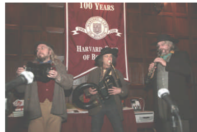
The Christmas Revelers