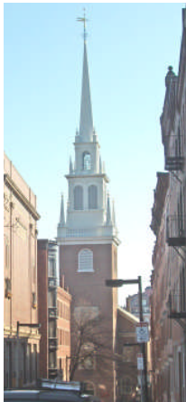
Old North Church